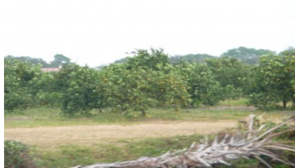
We passed orange grove after orange grove.