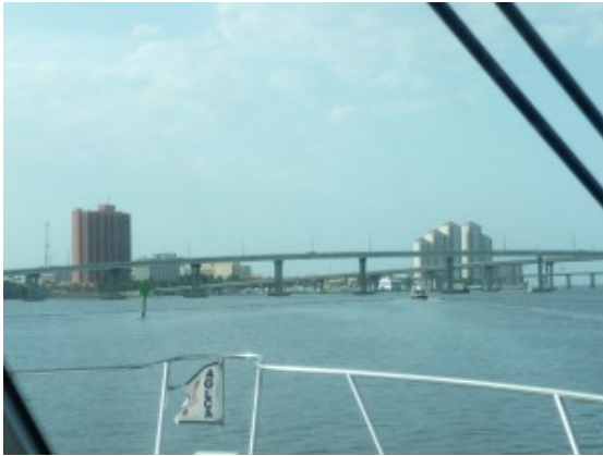
Approaching Ft. Meyers