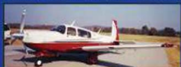
2006 MOONEY M20R OVATION2 GX 80 TT, 80 SNEW, Ovation 3 Upgrades, Garmin 1009, Air, O2, One Owner, Like New P&I, NDH.