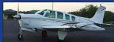
1998 BEECHCRAFT A36 720 TT, King Dig, KLN 90B, KFC-150 AP, Air, 1 Owner, Like New P&I, NDH, Reduced $369,500!