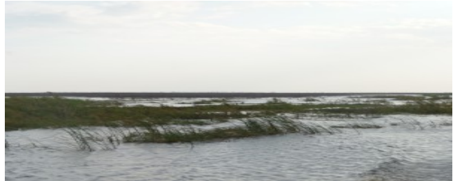
Our travels started off barren and swampy.