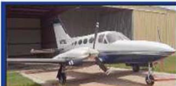
1978 CESSNA 421C 4693 TT, 589/995 SMOH, Collins Dig Radios, KLN89B(IFR), Rdr, Slaved HSI, Known Ice, NDH.

Call Us for a FREE Evaluation of your aircraft. No Obligation