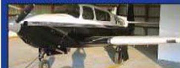
2000 MOONEY M20R OVATION2 230 TT, GNS 430s, WX950, Air, Oxy, KFC225 w/preselect, NDH, Reduced to sell $299,500!