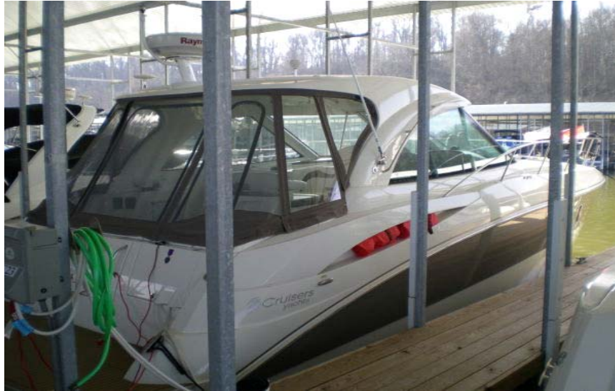
2007 Cruisers 390 Sports Coupe Excellent Condition!