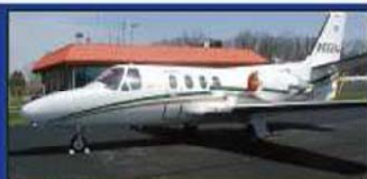
1978 CITATION ISP 6572 TT, 3182/3090 SMOH, Fresh Phase I-V, V by Eagle. Pro-Line, KLN90B, Freon Air, TR's, Aft Bagg. Mod. P&I 2000, NDH. Reduced $774,500!

REMINDER — All Captains Club benefits end Dec 31, 2008 if you have not paid your 2009 dues.