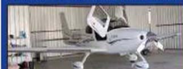
2005 CIRRUS SR22-GTS 520 TT, 520 SNEW, Fully Loaded, TKS, Extended Warranty until May 2008, Maintained by Epps, Beautiful P&I, NDH, Reduced $349,500.